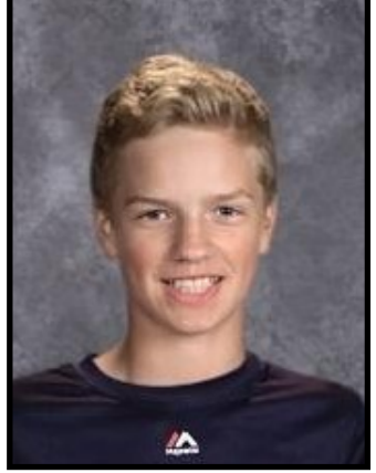
"All I Want for Christmas is You" because it's good - Cooper L, 9th grade