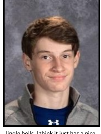
Jingle bells, I think it just has a nice tune.—Eli R, 10th grade