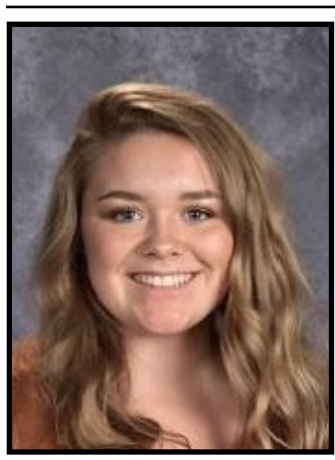
Probably "Last Christmas" bv Ariana Grande because it tells about Christmas spirt but not super overwhelming to where I get annoyed with it quickly.—Madden L, 11th grade