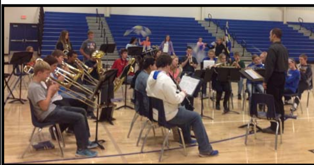
The Garretson Band plays "The Star Spangled Banner" at the opening of the Veteran's Day program while the color guard performs behind.