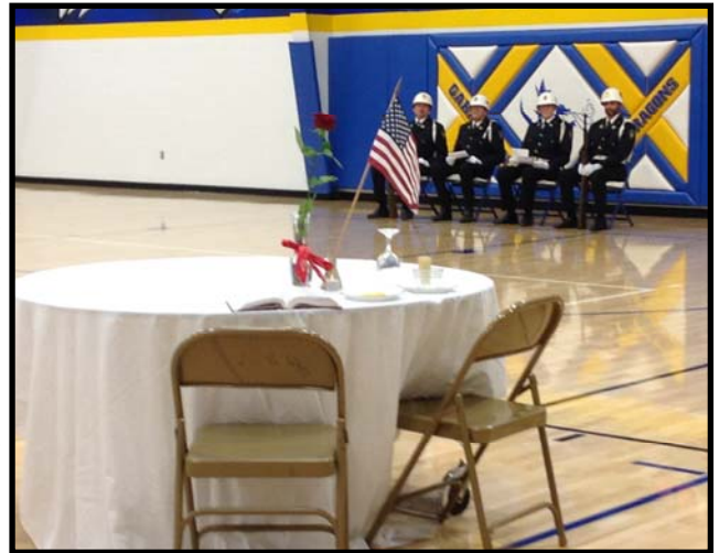
An empty table, set to honor and symbolize the veterans who have not returned home.

This day is dedicated to these brave soldiers and anyone can find a way to give their