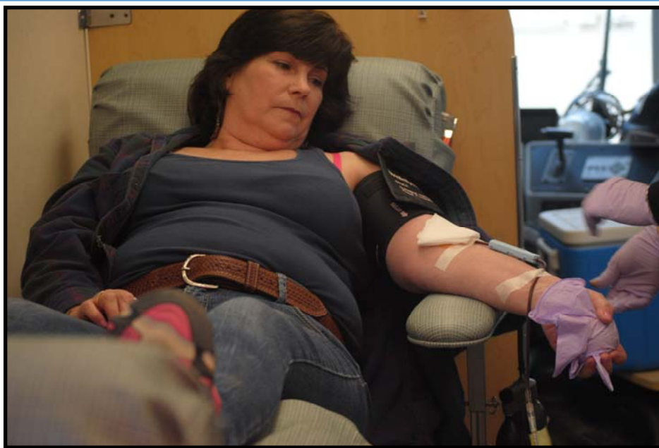
A community member came to the Garretson School to give blood while the Bloodmobile was in town on Thursday, sponsored by the Garretson FFA.

According to the Community Blood Bank, donations are limited and so is the supply of blood to patients.