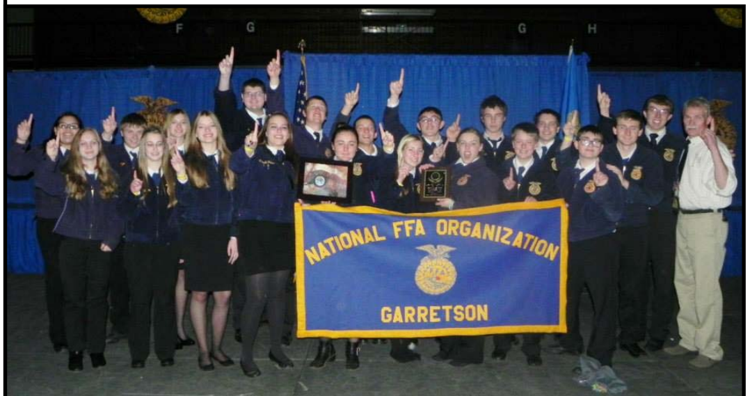
The Garretson FFA celebrates their accomplishment of achieving the top chapter in the state of South Dakota. This is Garretson's 13th state title in 17 years.

Some of the categories that Garretson Continued on page 3