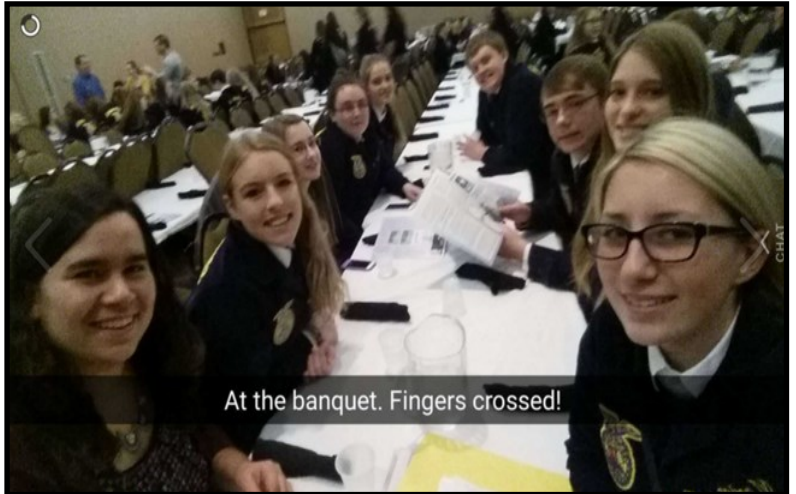
The Garretson FFA team waits at the banquet for results from the state contests.

chapters as far north as Milbank and as far west as Rapid City. However, the chapter that ran away with most of the contests was Viborg-Hurley. Despite this, Garretson’s FFA chapter looks forward to returning to the contests next year and bringing on the heat.