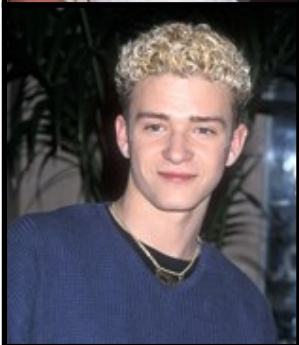
Classic hairstyles of the '90s as worn by Britney Spears (top), Danielle Fishel (middle), and Justin Timberlake (bottom).

mented, "Yikers...kinda glad that stuff still isn't around!"