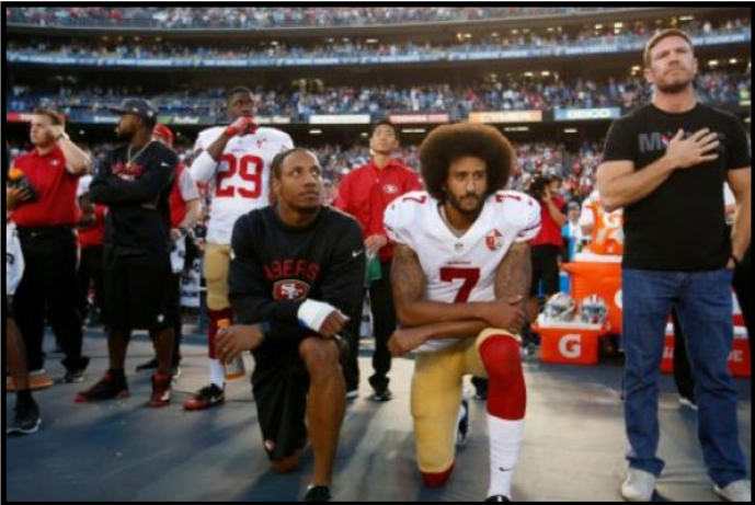
Colin Kaepernick originally spurred conversation about not standing during the national anthem last year but it has taken on a whole new life during the current NFL season.