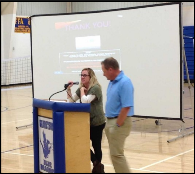
Carroll Institute presented on social media awareness, potential internet dangers, as well as possible repercussions of actions. While being aware that youth will utilize technology, it is important to be safe with it as well.

The assembly brought to light a lot of risks involved that can come out of illegal activities that happen on their cell phones or through different apps they may be using. The students learned a lot of new information that will hopefully impact their future for the better.