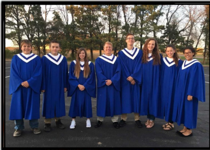
All-State choir participants and alternates participated at the BEC honor choir earlier this week.