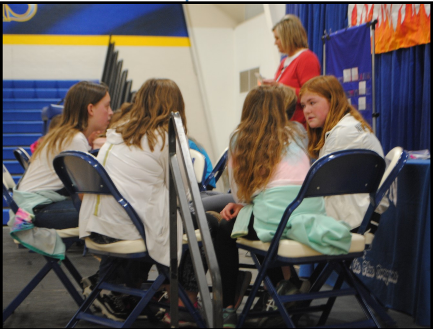
With the book battles in progress featuring Garretson hosting Baltic, the Garretson team conferences, making sure they are in agreement with their answer.