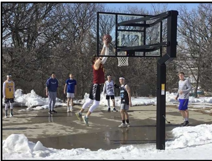
In addition to a busy school environment, the Garretson boys added to the excitement of the school year with their own league that they created. The DBL seemed to get just as much of a following as other school sports.

This year has gone by so fast but let's hope summer doesn't!