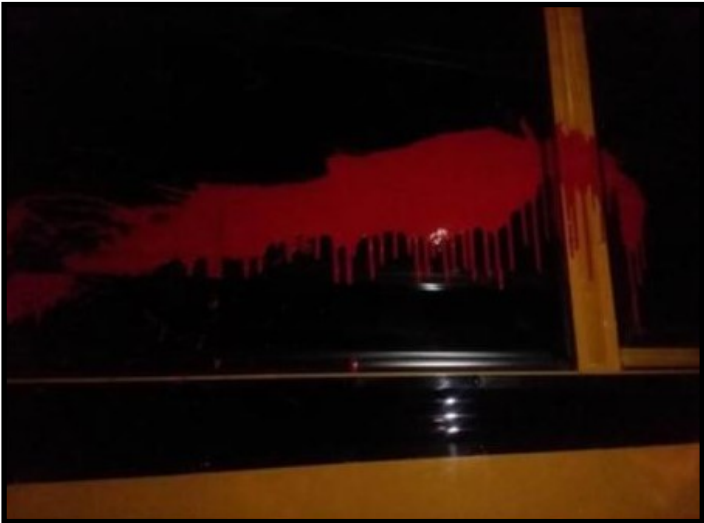
While Wagner and Redfield faced off on the gridiron, the visiting bus didn’t fair very well, getting splattered with paint. Redfield school officials have apologized to Wagner about the incident.

the campus. I guess the troublesome kids weren’t satisfied, because shortly after that, the bus was egged. The Redfield school officials and staff have issued apologies to the Wagner community, as they don’t want these “thoughtless actions” to reflect upon them or for the community to feel these incidents “accurately represent Redfield.” Charged have yet to be filed, as there is still no information as to the identity of the suspects.